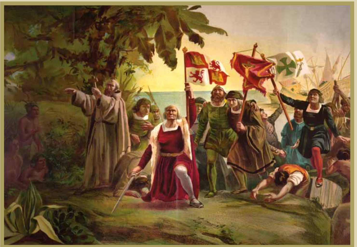
Columbus and his crew land in the New World, October 12, 1492