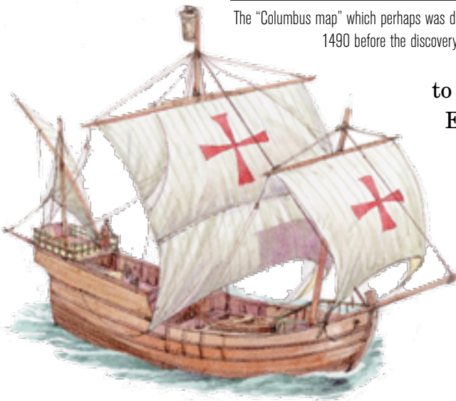
Drawing of the Pinta , one of the three ships which sailed to the New World with Christopher Columbus.

to reach Oriental countries that European countries wanted to do business with. He thought he could find a route across the ocean that would be shorter and faster than the old slow way of traveling thousands of miles by land. But on his first voyage he bumped into a little island off the coast of Florida. And that was the beginning of the settlement of America.