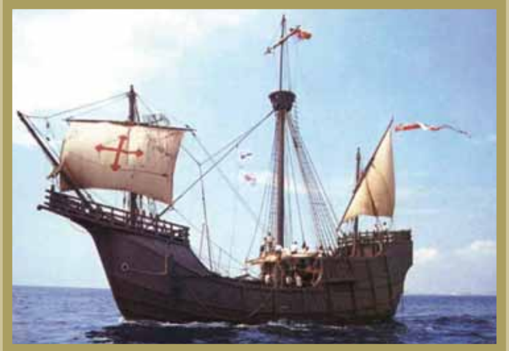
Replica of the Santa Maria , Columbus' flagship.